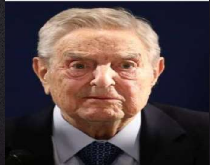
GEORGE SOROS King of Forex Trading